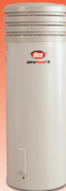
STCs Table – Heat Pump

*Tested at 18°C ambient and 40% humidity.